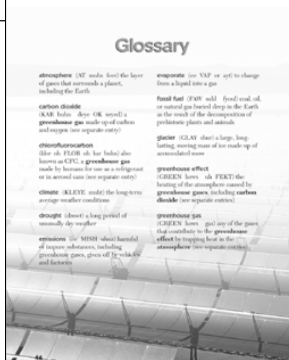
Sample pages from Global Warming Student Book